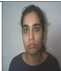
Test Day Photo